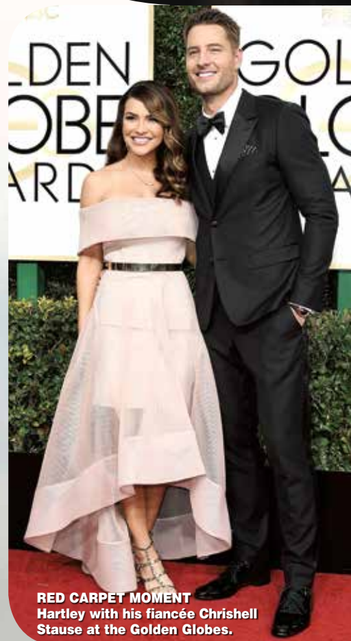
RED CARPET MOMENT Hartley with his fiancée Chrishell Stause at the Golden Globes.